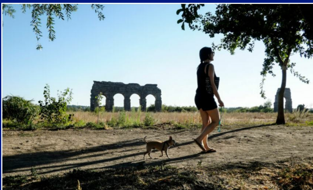
A woman walks a dog near the ruins of an ancient Roman aqueduct, in a park in a suburb of Rome, on July 28, 2017.